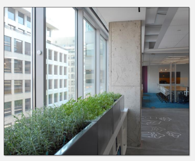
Herb Garden: ASID HQ, Washington, DC (WELL certified)