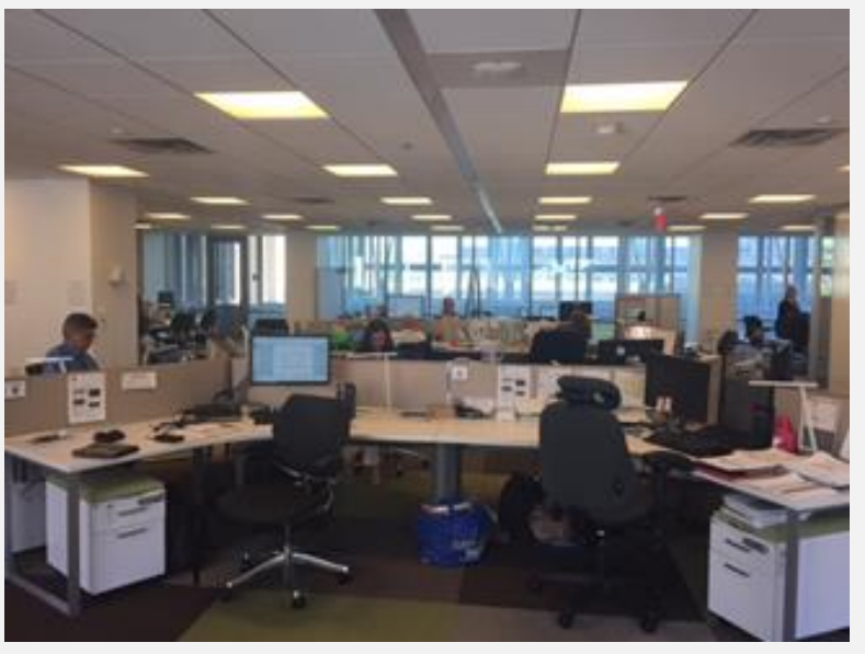
Open plan, daylit workspace: GSA: Central Office (Washington, DC)